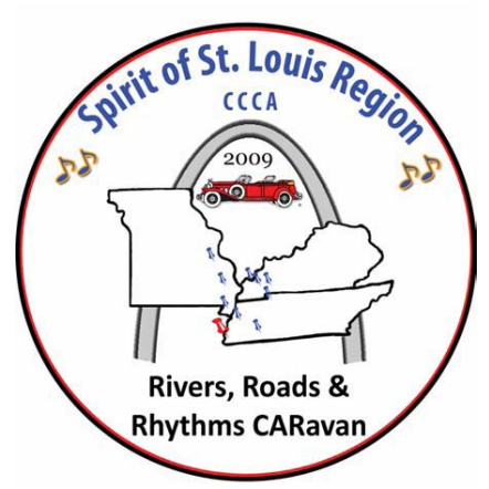
September 18-26, 2009 The Spirit of St. Louis Region would welcome your presence

The next annual meeting will be January 6-10, 2010 in San Diego and Palm Springs. I urge all of you to consider attending.