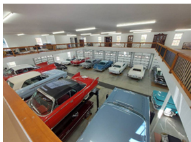
Cars from the Nickett collection