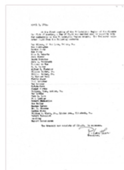
Attendance and minutes from the first meeting, reprinted on p. 3