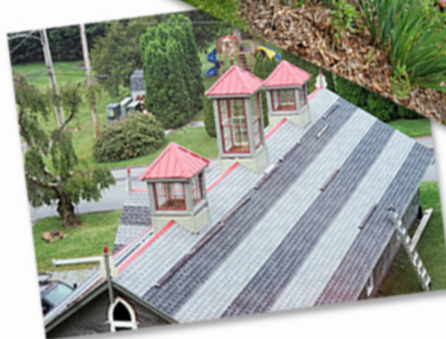
Gothic Aerie home and garage