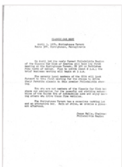
Invitation to the first meeting, reprinted above

Visit their website at springhousetavern.com .